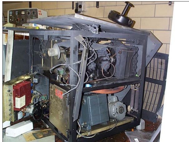
1. Centrifuge Exterior - Cornell