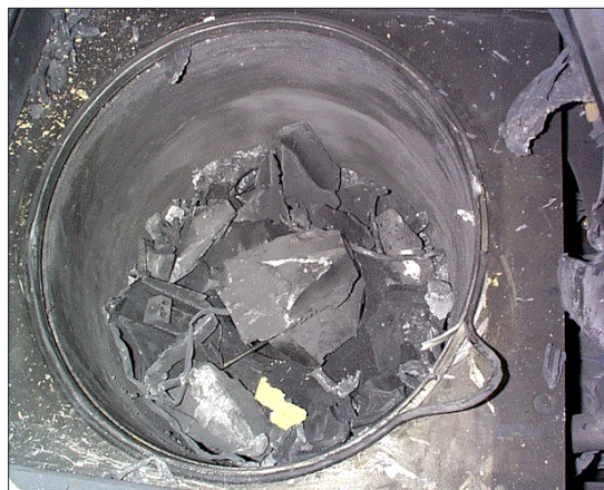
2. Centrifuge Interior - Cornell