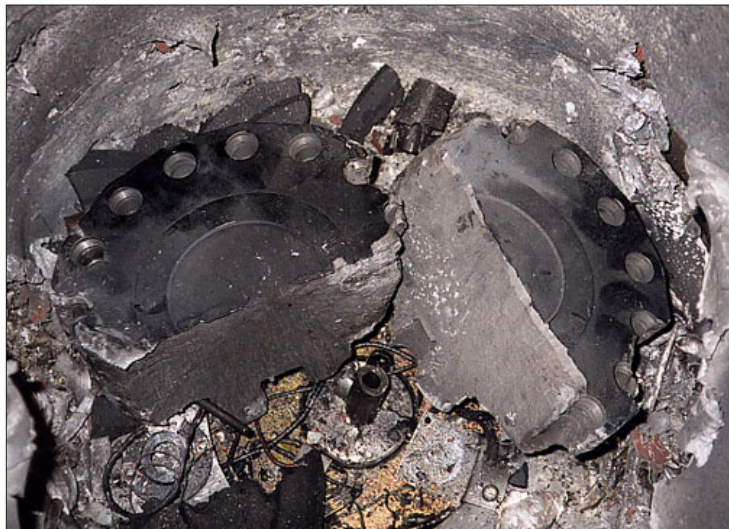
4. Centrifuge Interior - MIT