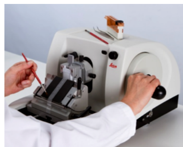
Examples of Microtomes