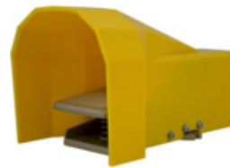
Guarded Foot Pedal